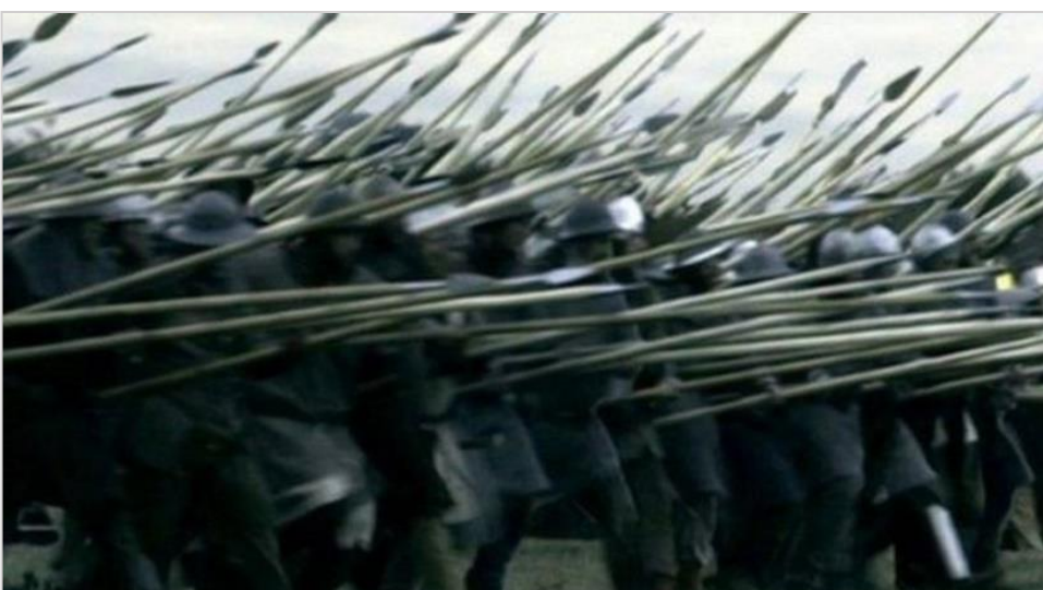
Angled pikes held by densely packed warriors, forming a schiltron.

There was a small stage for a storyteller, and a large stage for musicians. But the main show that the crowds came for was the "reenactment" of the Battle of Bannockburn. This required a large field